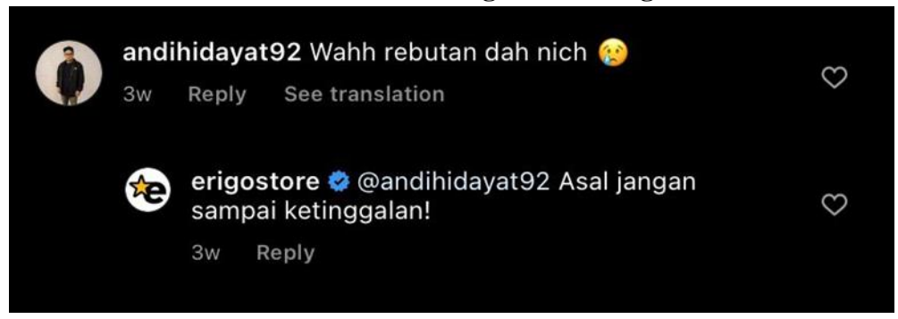
Figure 2 Comments of Followers on @erigostore Instagram Account

Figure 2 above shows a comment from one of Erigo's followers on Instagram. A follower with the @andihidayat92 Instagram account commented "Wow, we have to battle it out" on Erigo's post announcing Erigo's exhibition at the Local Fest event. This comment shows the excitement of followers for the buy 1 get 3 promotion offered by erigo at the event.