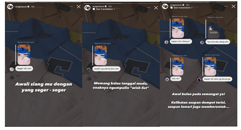
Figure 3 Interpersonal Communication Skill Sales Person on @erigostore Instagram Account

The results in this study found that buy 1 get 1 promotion partially had a significant influence on the impulsive purchases of followers of instagram accounts @erigostore. The findings in this study are the same as the results of a study conducted by Andani dan Wahyono (2018) which explained that promotion has a positive and significant effect on consumers' impulsive purchases, one of which is the buy 1 get 1 promotion. Another marketing strategy used by Erigo is the approach through the application of interpersonal communication skills of sales persons or establishing interpersonal closeness with the target audience through communication built on the Instagram account @erigostore. One of the efforts made by Erigo in building communication is to interact by replying to messages that enter the direct messages of @erigostore Instagram account, as shown in Figure 3 below.