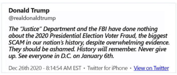
Figure 4. Trump's tweet (December 26, 2020)

The representation displayed in the text is Trump's surreptitiously urging his fervent followers to be "up in arms & fighting," which literally means "holding the arms & fighting" to respond to the alleged election frauds as discoursed by Trump. Trump also expressed his disappointment with the eight Republican Senators he supported since they did not do anything for him. The relation displayed in the text is "Republicans," or voters of the Republican Party, as the party harmed by the election fraud, so they were provoked to really up in arms. The identity displayed in the text besides Trump as a discourse maker was that of Republicans and the eight Republican senators who had won the elections thanks to Trump's endorsement but did not support Trump's election fraud discourse.