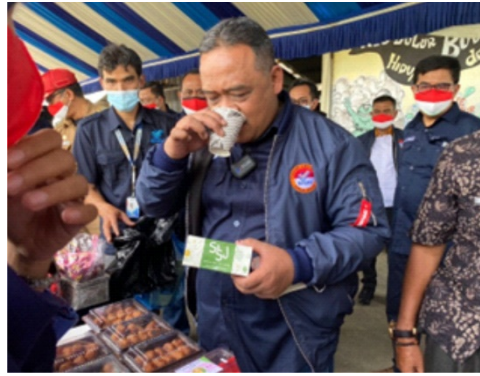
Figure 3. Consumen Trying and Buying Cumin Tea Products at the I-MASARO Secretariat