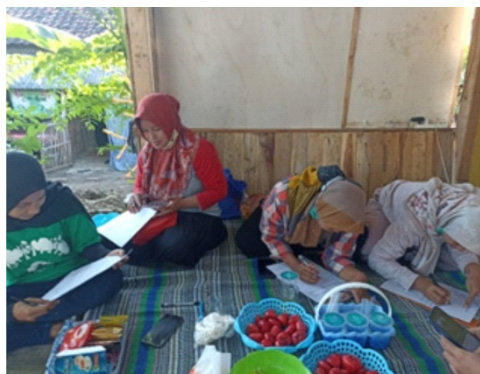
Figure 4. Preparation for taking care of the SP-PIRT Licensing (Assistance by PT. Polytama Propindo)

Activities to build community relations (public relations) are carried out by building synergistic cooperation with PT. Polytama Propindo. This well-established relationship is also more aimed at empowering the CBO IBU TIN, especially in mentoring activities, such as disseminating information to develop cumin tea in various ways from preparing to the production stage, providing assistance in obtaining SP-PIRT licensing, and providing opportunities to CBO IBU TIN at several exhibitions as a means to market cumin tea more broadly to the public. The SP-PIRT license is used as a guarantee that the cumin tea product developed by CBO IBU TIN is appropriate and passes food safety requirements. This synergistic relationship gives CBO IBU TIN many benefits, especially in terms of developing cumin tea products, from assistance (preparation and production) to licensing assistance.