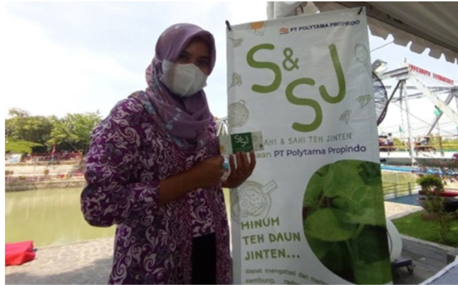
Figure 2. X-Banner Display of Cumin Tea Products