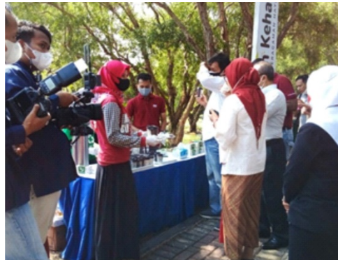
Figure 5. The Regent of Indramayu Visits the Jinten Tea Product Booth at the Inauguration of the Timorensis Deer Breeding at Taman Keanekaragaman Hayati (KEHATI) Indramayu

inappropriate if it is carried out by CBO IBU TIN, which incidentally is an empowerment-based MSME. Cumin tea products for the first time had the opportunity to fill the product booth at the inauguration of the Timorensis Deer Breeding at Taman Keanekaragaman Hayati (KEHATI) Indramayu in August 2021. Another event was the implementation of World Clean Up Day 2021 which was held in September 2021. Apart from these two exhibitions, there was no other exhibition that was participated by CBO IBU TIN. However, the participation of CBO IBU TIN in the exhibition shows that their cumin tea products are ready to be marketed to the wider community.