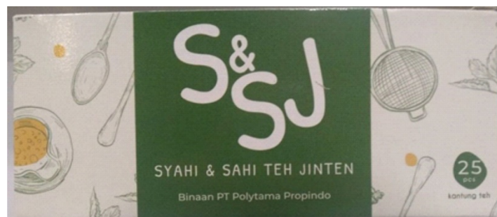
Figure 6. Cumin Tea Product Packaging

The packaging of cumin tea products is also part of the implementation of IMC elements, from which previously only made of plastic and aluminum foil paper to finally be packaged in good packaging. The good packaging of this cumin tea product can add value and become a medium for carrying messages to the public. We can't imagine what if this product is distributed in plastic packaging and aluminum foil.